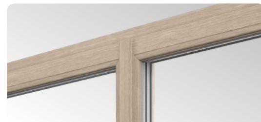
Slender profiles with a narrow post equipped with double seal which is a novelty in this kind of solutions on the market.