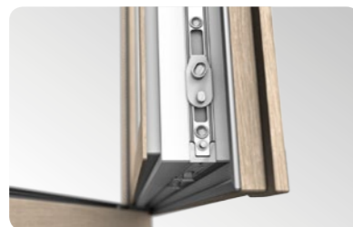
High quality Maco Multi Matic KS fitting with two anti-theft hooks as a fittings standard.